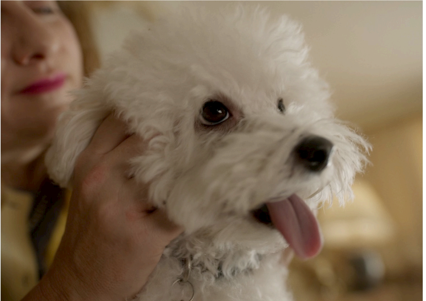
BELLA THE DOG.